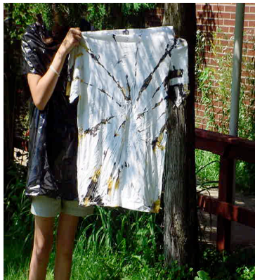
We made t-shirts.