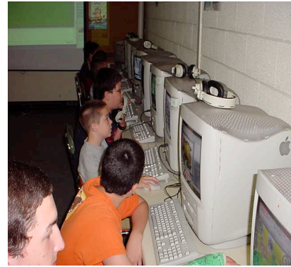
We are making our own Powerpoint presentation.