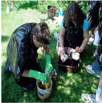
We made tie-dyed t-shirts