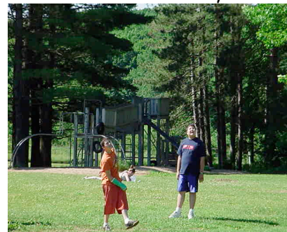
Punting for our daily Training Camp