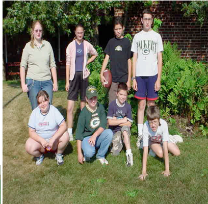
We took a picture on the last day.